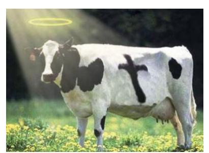
Holy cow = Holy shit

He advised me not to go into the literal meaning of it as long as I was in